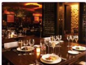
Hotels & Restaurants