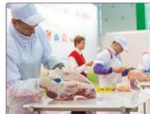
Dairy & Meat Industry