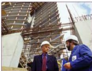
Construction & Building