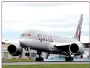
Airline & Aviation