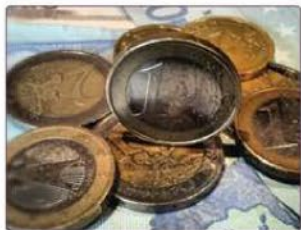
Account & Finance