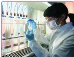
Chemical & Biotech