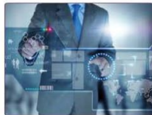
IT Software & Hardware